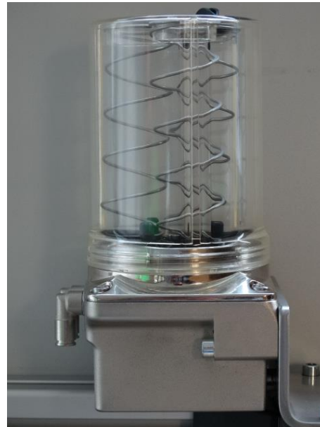
Figure 2: LUB-B-2 side view