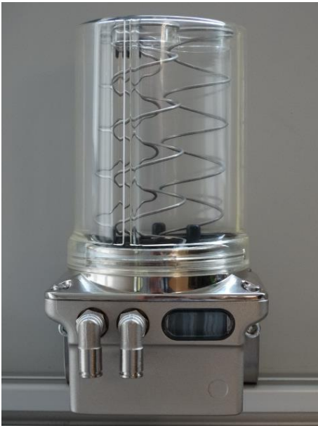
Figure 1: LUB-B-2 front view

Battery powered for grease with two outlets