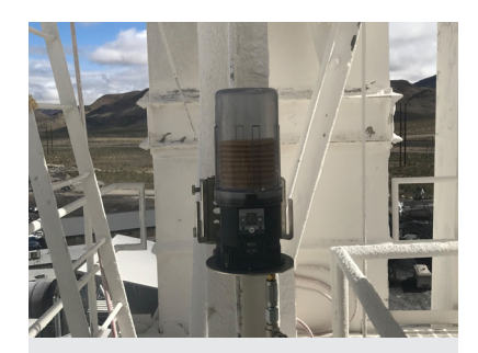
Industry: Quarrying industry Application: Shaker screen