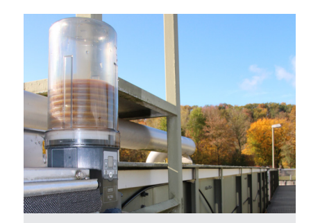
Industry: Sewage treatment plants Application: Rotary screen