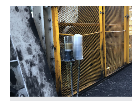
Industry: Quarrying industry Application: Belt conveyor